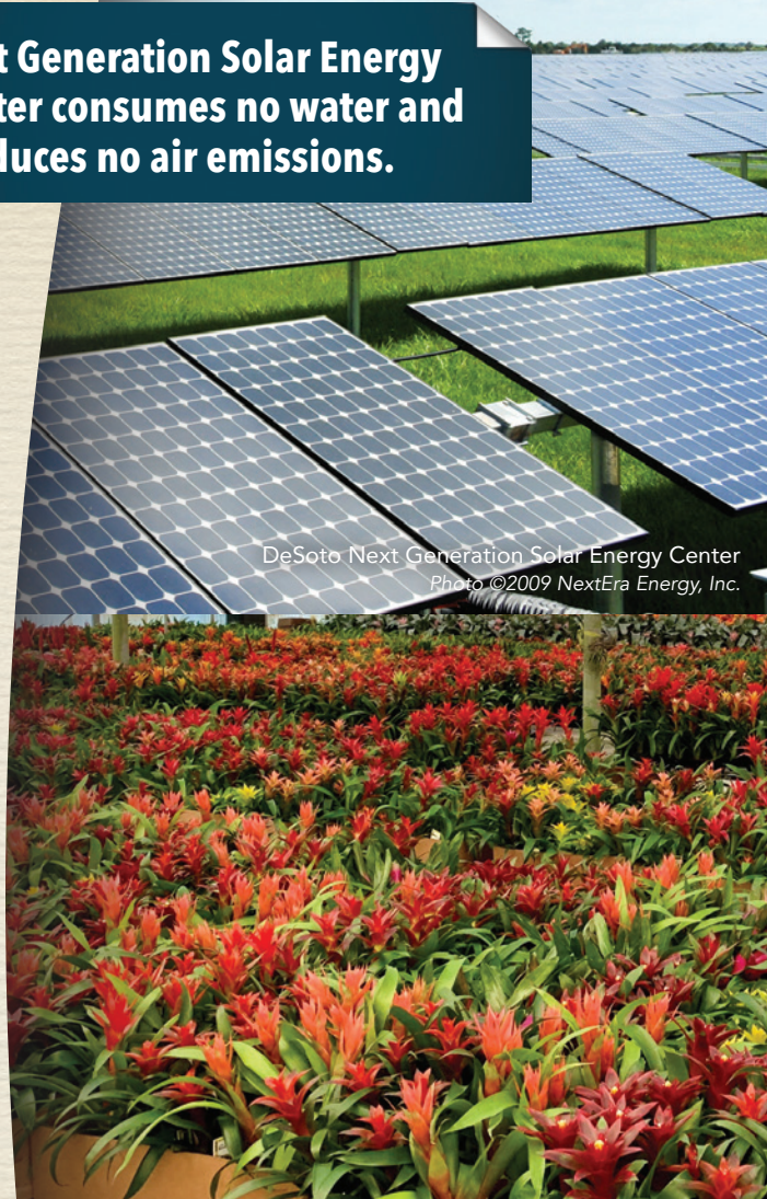
DeSoto Next Generation Solar Energy Center

Next Generation Solar Energy Center consumes no water and produces no air emissions.